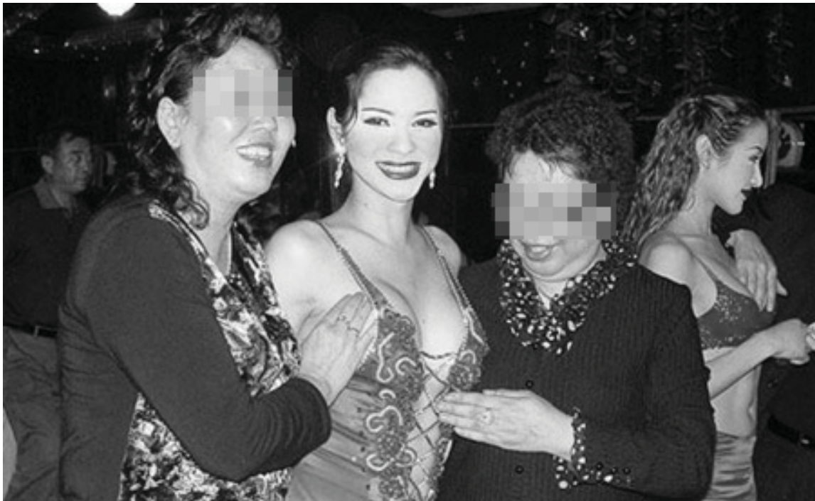
Figure 3: Two middle aged women are checking the breasts of a ladyboy. 28

in oral form; 26 alternatively, the author uses the daily speaking form as their articles intertextuality. In this period, ladyboys as a hot topic on the internet is not a history issue or societal phenomenon, but a very sensuous flesh issue. The discourse is so focused on flesh that there is nothing but the sensuous/charming flesh of a ladyboy. During this period, the equation that Thailand equals ladyboys, and ladyboys equals (special) flesh, has been set up. According to Lippman's definition of stereotype, 27 the equation has already become the stereotype of Thailand.