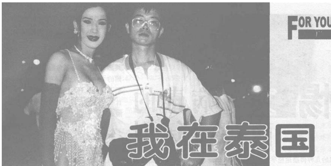
Figure 2: The author of an article about ladyboys in Thailand from a magazine in the 1990s stands seriously besides a ladyboy. 23

After 2000, with the rise of the internet, ladyboys became a very popular topic on Chinese internet websites, whereas the topic almost disappeared from popular magazines. If entering ‘Thailand ladyboy’ in Chinese (泰国人妖) in Google , the number of Chinese web sites is 6,500,000, and if entering ‘Thailand’ in Chinese (泰国) in Baidu , the most popular Chinese search engine, there will automatically be two phrases, the picture of a Thailand ladyboy and the election of queen of ladyboys in Thailand , and these two phrases are the top two in the searching list. 24 In one word, ladyboys is the main topic about Thailand on China’s internet. In this period, the vocabulary of these articles is informal and sensual, they can induce very strong sensual feelings, and there are always pictures besides the articles. The gesture and expression is often casual and relaxed, sometimes the author is even shown touching the breast of a ladyboy (See Figure 3). The force of utterance is weak, the author often tries their best to appeal to the attention of the readers. The genre is not serious, especially some blogs. 25 The grammar of these articles is poor, and sentences are often